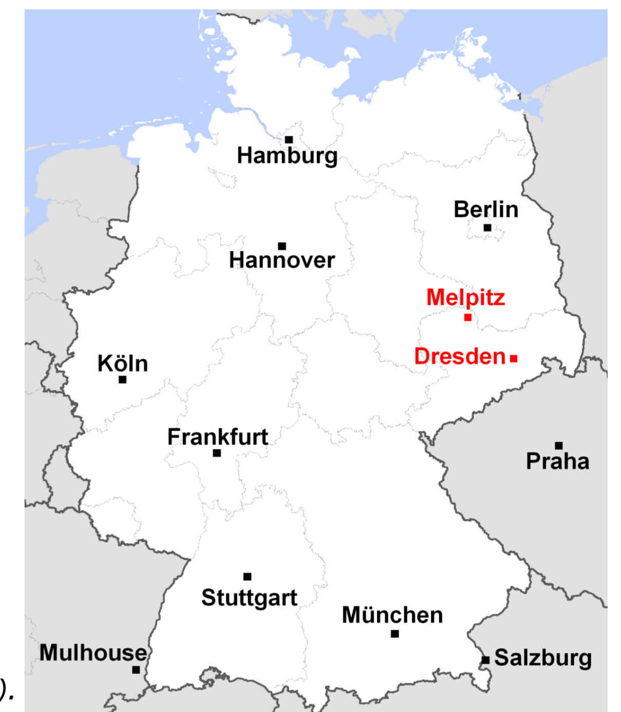
Fig. 1: Location of the sampling sites in Germany (shown in red).

A measurement is started using weather forecasts, as a constant air mass origin and dry weather conditions are needed during the 24 hour sampling period. The sampled air volume is 108 m 3 in each case. Aerosol samples are analysed for mass, main ions (sulfate, nitrate, chloride, ammonium, sodium, potassium, magnesium, calcium), organic carbon, elementary carbon and various single organic compounds such as long-chain n-alkanes and PAHs.