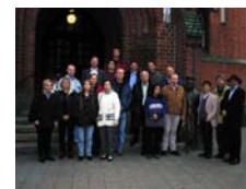
The FEBUKO team